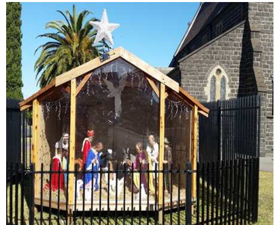
Crib Scene at Ss Peter & Paul's